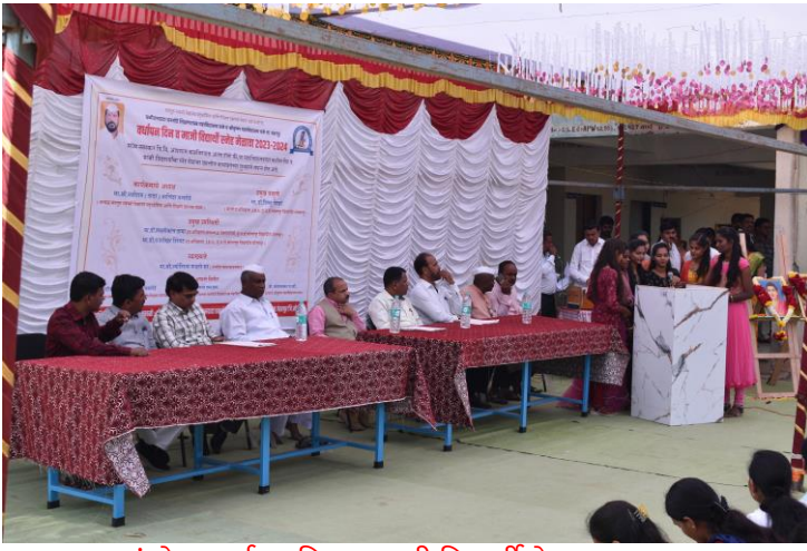
संस्थेचा वर्धापन दिन व माजी विद्यार्थी मेळावा