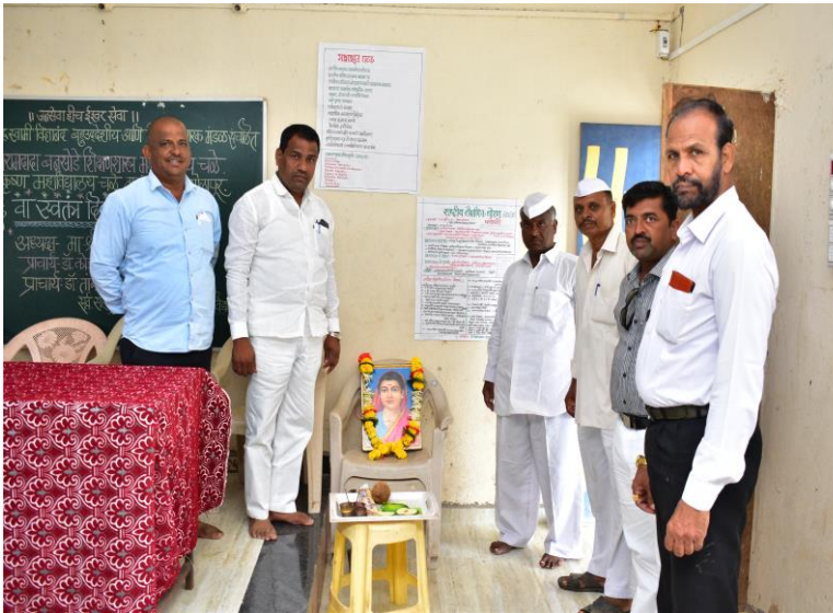
बालिका दिन ( सांस्कृतिक कार्यक्रम )