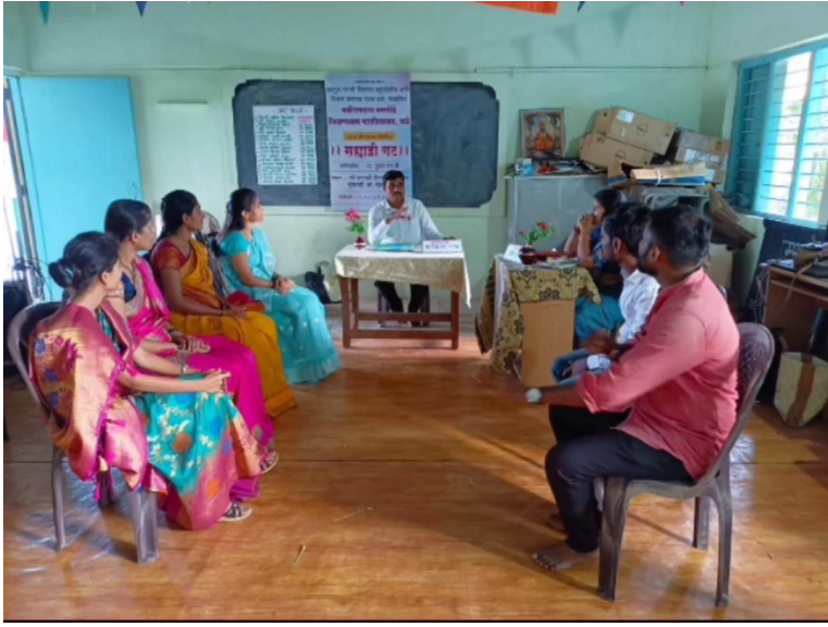
शालेय आंतरवासितामध्ये अभिरूप मुख्याद्यापक व प्रशिक्षणार्थी