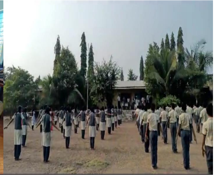
शालेय क्रीडांगणावर कवायत प्रकार घेताना