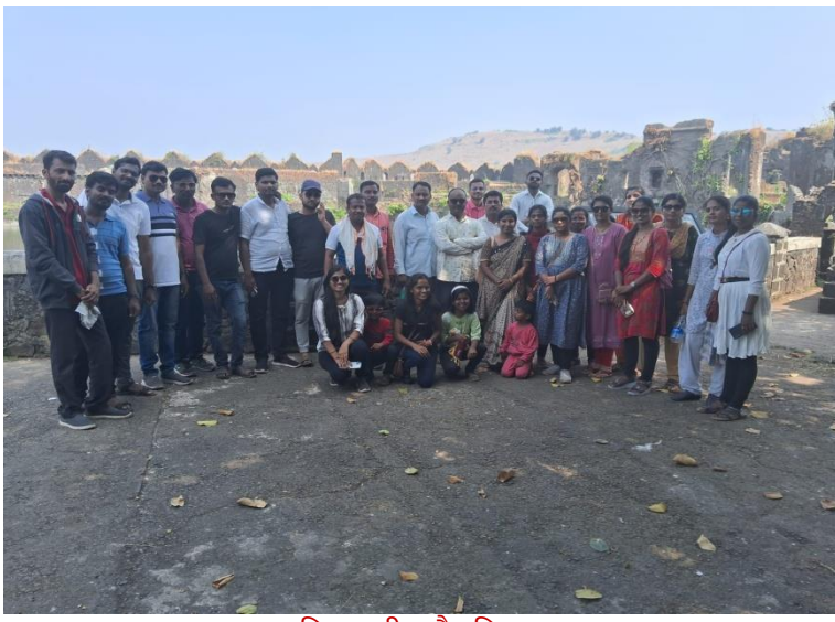
महाविद्यालयीन शैक्षणिक सहल