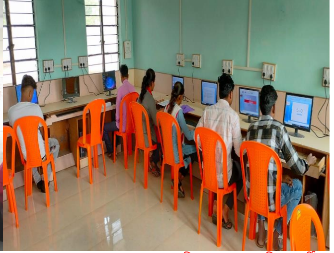
ICT प्रात्यक्षिक करताना प्रशिक्षणार्थी