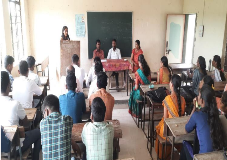
विद्यार्थी मनोगत व्यक्त करताना