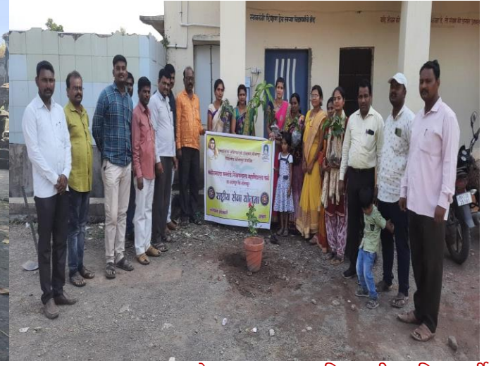
समाजसेवा करताना महाविद्यालयीन प्रशिक्षणार्थी